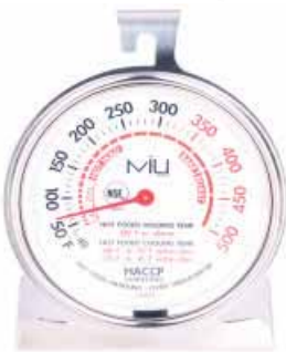
90069 Thermometer, 3” dial Commercial oven NSF Certified List $15

8-inch face measures temperatures from 100 to 400°F Face shows proper candy temperatures, from “thread” to “hard-crack”. Insulated handle’s adjustable clip secures thermometer to pan. Made of stainless steel; 12 inches long overall.