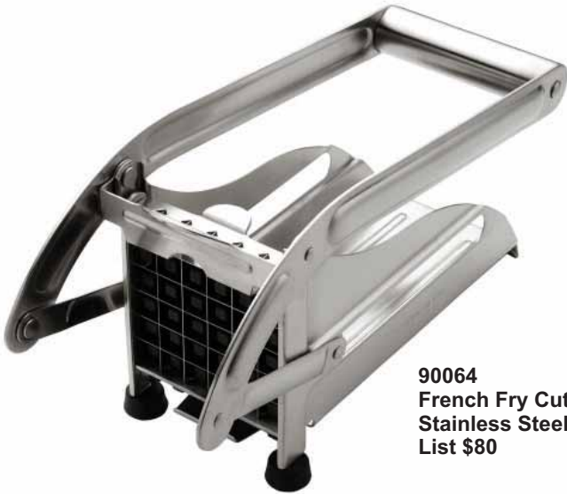
90064 French Fry Cutter Stainless Steel List $80