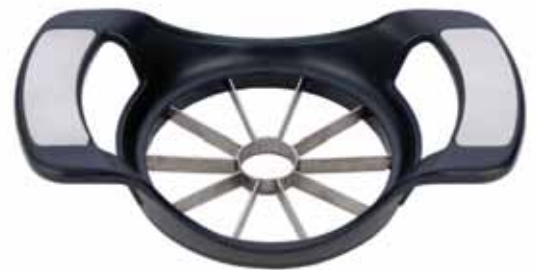
764 Composite Apple Cutter & Corer List $12