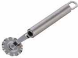
11201 Small Pastry Cutter List $12