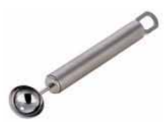
11211 Melon Baller List $12