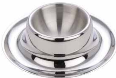
3006 Egg Cup Stainless Steel List $6