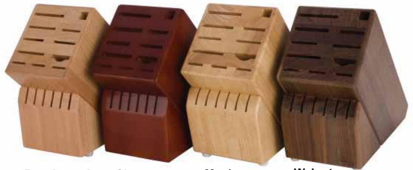
Beechwood Cherry Maple Walnut