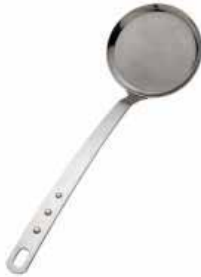
10909 Mesh Skimmer 18/10 SS List $20