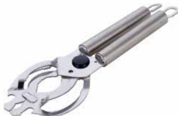
11221 Jar Opener List $22