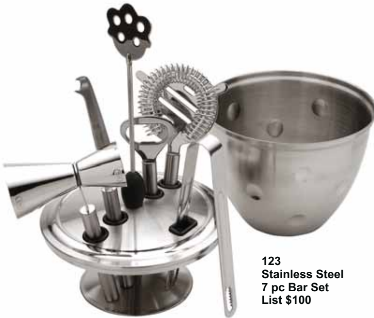
123 Stainless Steel 7 pc Bar Set List $100