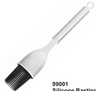
99001 Silicone Basting Brush Stainless Steel Handle List $10