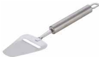
11206 Cheese Planer List $13