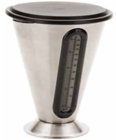
3650 Stainless Steel Measuring Beaker w/ lid List $38