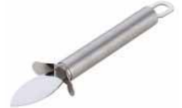
11239 Oyster Shucker List $10