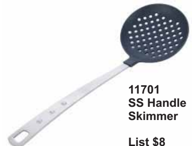
11701 SS Handle Skimmer