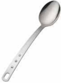
10902 Cooking Spoon 18/10 SS List $20