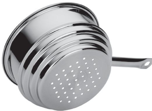
95042 3qt Universal Steamer List $40