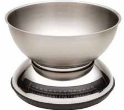
3592 Stainless Steel 7 lb Kitchen Scale List $75