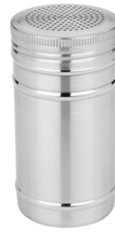
3436 Stainless Steel Spice Shaker List $20