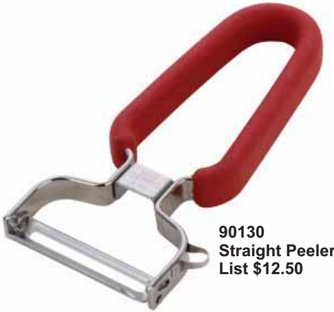
90130 Straight Peeler List $12.50