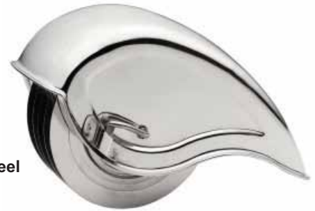
93262 Stainless Steel Herb Mincer List $40