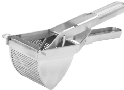
3556 Stainless Steel Potato Press List $60