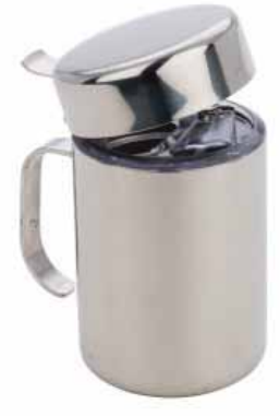
3061 Stainless Steel 16oz Oil Can List $34