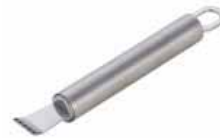
11236 Lemon Zester List $10