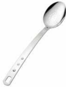
10906 Perforated Spoon 18/10 SS List $20