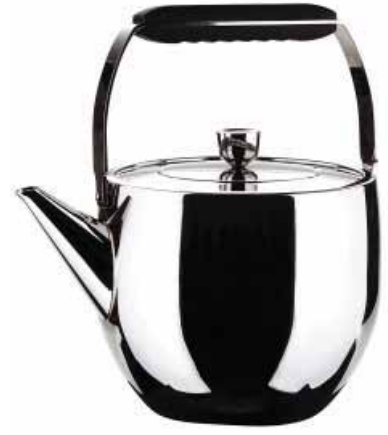
3775 Stainless Steel Tea Kettle - 1 qt List $130