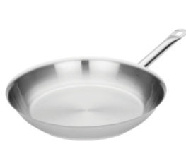
95037 8" Open Fry pan List $40

MIU commercial cookware is composed of 18/10 brush stainless steel interior along with a 5mm aluminum disk for conductivity and encapsulated with 0.5mm high impact bonded bottom for induction cooktop. Each piece is fitted with a stay cool stainless steel tube handle mounted to the body with six precision spot weld. The fry pans are arc shaped for easy pouring. The body has a mirror finished and fitted with a rolled edge for additional strength. Whitford Eclipse non-stick surface give years of carefree service.