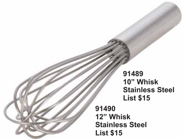
91489 10" Whisk Stainless Steel List $15