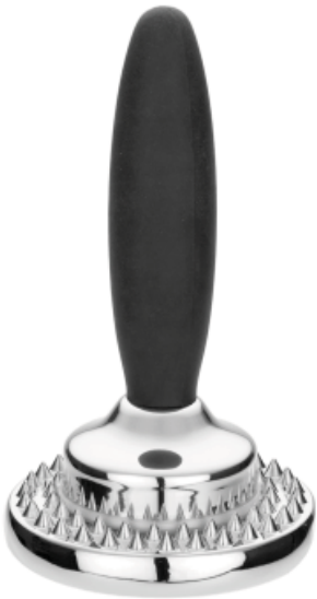
90102 Stainless Steel 2lb Meat Pounder / Tenderizer List $40