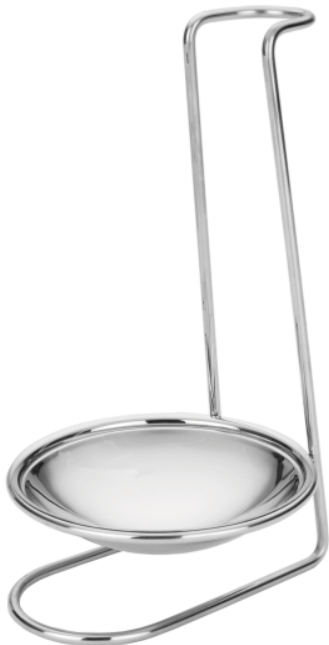
3427 Stainless Steel Soup Ladle Stand List $20