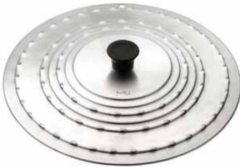
10005 12" Diameter SS Universal Fry Pan Cover List $30