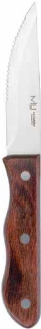
90054 4.5" Pakkawood Handle Set of 4 List $40