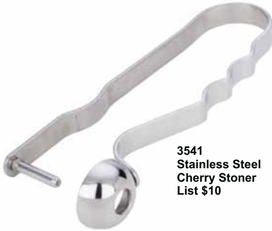
3541 Stainless Steel Cherry Stoner List $10

This deluxe kit sets the standard for decorating. The stainless steel disks and nozzles will stand up to years of use. Varies patterns offer a style for any occasion. The ratchet dispensing gun loads and dispense easily with its large trigger. Takes apart for fast cleanup.