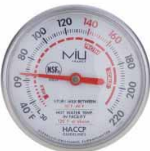
90070 Instant Read Analog Milk frothing Thermometer NSF Certified List $10

1 3/4" dial face Extra large retaining clip for attaching Ranges from 0-220°F 6" stem Clear and accurate temperature readings