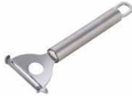
11224 Vegetable Peeler List $12