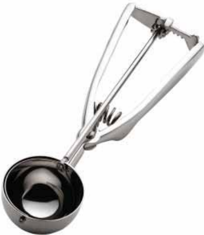
Stainless Steel Portion Scoop 91634 - Size #10 91633 - Size #12 91629 - Size #24 91628 - Size #30 91627 - Size #40 91625 - Size #60 List $20