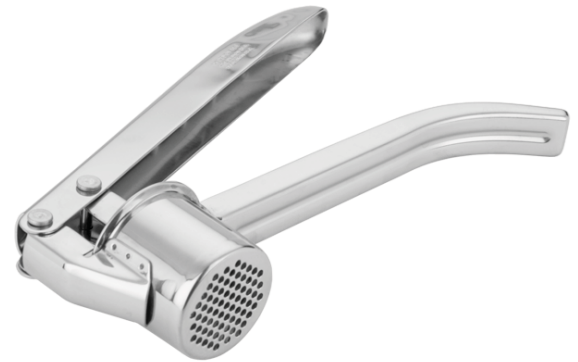
90016 SS Jumbo Garlic Press List $20