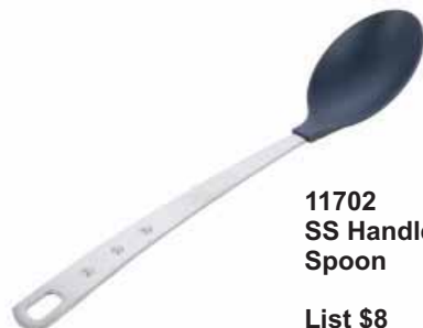
11702 SS Handle Spoon