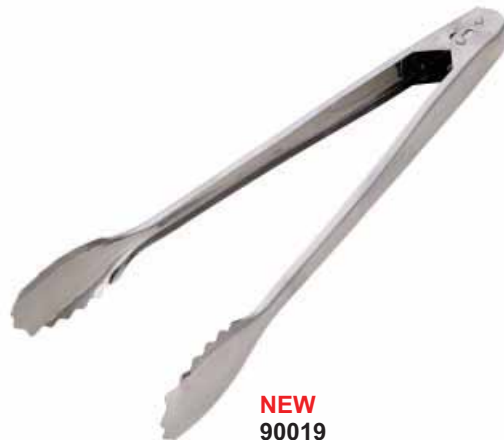
NEW 90019 Stainless Steel BBQ Tong 16" List $15