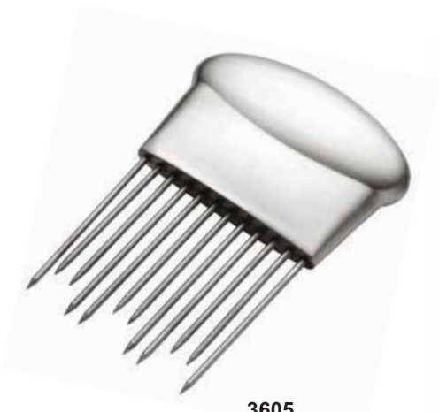
3605 Stainless Steel Meat Holder List $20