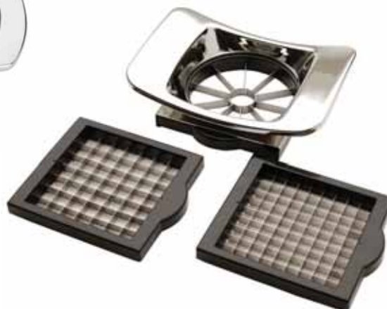
3249 Apple Cutter & Corer French Fry Cutter List $48