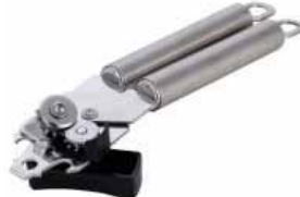
11219 Can Opener List $24