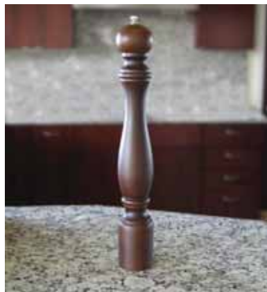
90608 Peppermill, 8" List $35

A beautiful classic exterior design combines with a powerful interior to create an attractive and exacting pepper mill. The secret is the "Sure Lock" hardened steel grinding mechanism that ensures perfect consistency every time with a simple twist. Handcrafted from hardwood with a handsome walnut stain.