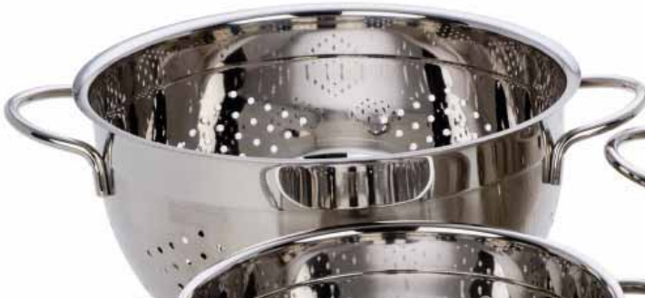
3131 7qt 11" diameter List $75