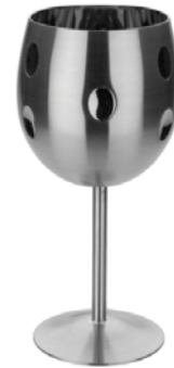
3702A Stainless Steel Dimpled Red Wine Glass List $24

Easy to use, only 3 steps. This connoisseur corkscrew has a cam lever design that makes even the most stubborn cork come out. Comes with a foil cutter, extra screw, and an elegant holder to display the unit.