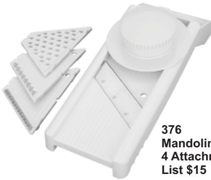
376 Mandoline with 4 Attachments List $15