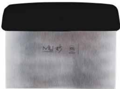
94009 Dough cutter / scraper List $12