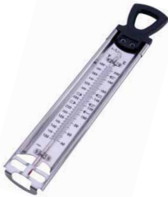
90049 Thermometer Deep Fry / Candy NSF Certified List $20

Sliding stainless steel clip attaches to side of any pan 8-inch glass candy thermometer great for stove-top use Non-mercuric, dual-scale column is easy to read Temperature range 75 to 400°F (25 to 200°C) Indicator shows temperature for different candy stages