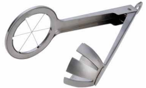
3255 Stainless Steel Egg Wedge List $30