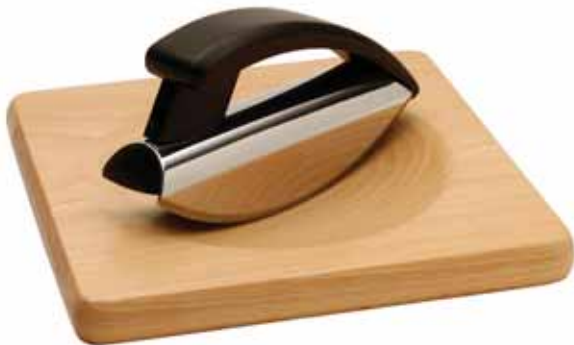
90059 Stainless Steel Mezzaluna w/ concave cutting board List $50