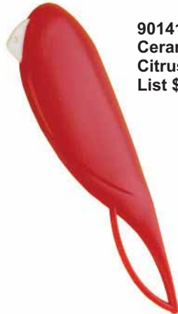
90141 Ceramic Citrus Peeler List $5