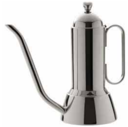
3722 Stainless Steel Italian Style Oil Can - 1 qt List $60