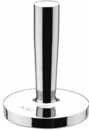
3600 Stainless Steel 2lb Meat Pounder List $60