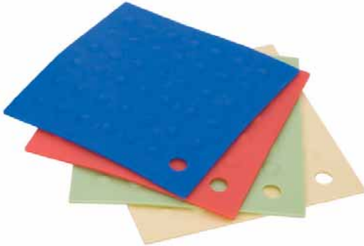
Silicone Pot Holders - 6.75" x 6.75" High heat resistant - Dishwasher safe