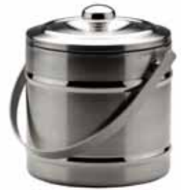
3425 Stainless Steel Ice Bucket - Double Wall List $120

Perfect size plastic bar board with non slip edges for slicing lemon, lime and other related items. It measure 8.25" x 5.5" x 0.5". Come in Cherry, Orange, Lemon and Lime colors. List $10