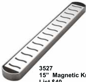
3527 15" Magnetic Knife Bar List $40

Grab the knife you need the first time. This sleek bar of brushed stainless steel has a powerful magnet that grips blades firmly for safe, convenient, high-visibility storage. Frees up precious counter space. Comes with mounting hardware