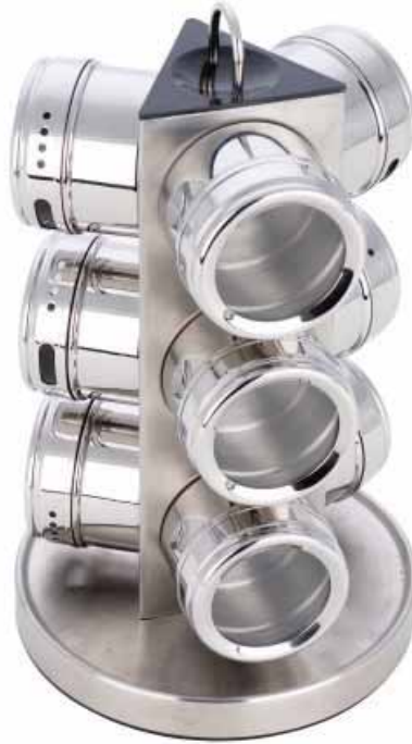
NEW - Special Order Only 3141 9 Jar Spinning Magnetic Spice Rack