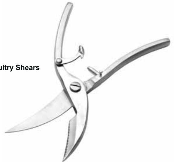
90060 Forged Poultry Shears 18/10 SS List $60