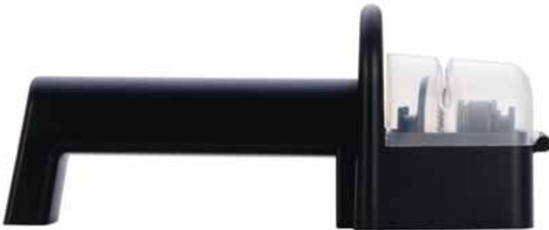
NEW 1190 Knife Sharpener List $20