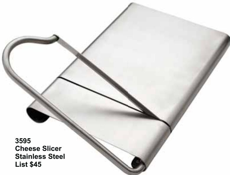
3595 Cheese Slicer Stainless Steel List $45