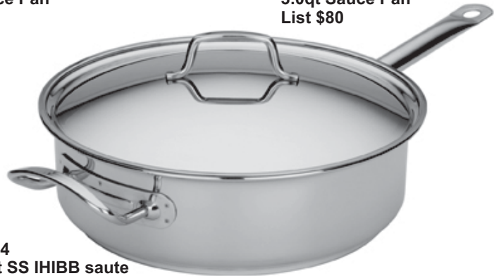
95034 5.5qt SS IHIBB saute List $120

95040 13 Piece Commercial Stay-Cool Handle Cookware