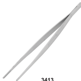
3413 Stainless Steel Chopstick Tongs List $12