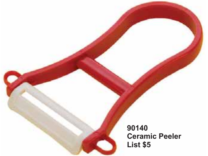
90140 Ceramic Peeler List $5