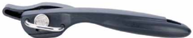
91600 Can-Do Can Opener No Sharp Edge Design List $20