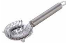
11202 Cocktail Whisk List $12