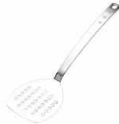
10904 Slotted Turner 18/10 SS List $20