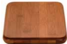
90028 6"x15"x0.75" List $20