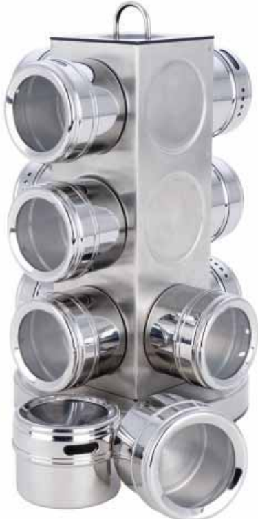
NEW - Special Order Only 3142 12 Jar Spinning Magnetic Spice Rack