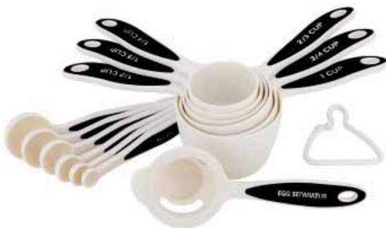
931 Plastic Measuring Cups/Spoons w/ egg separator - Set of 13 List $20