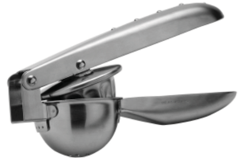
10004 Stainless Steel Citrus Squeezer List $40