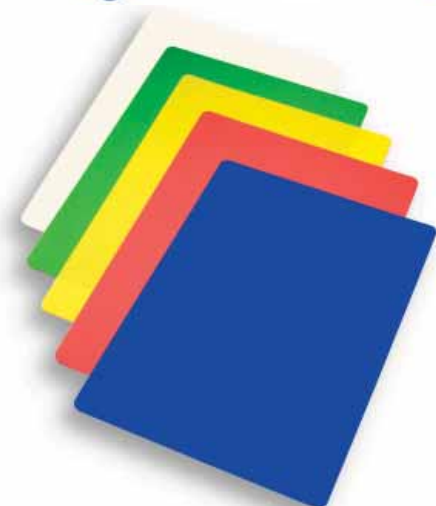
90005 Flexible Cutting Boards 11" x 17" - Set of 5 List $15