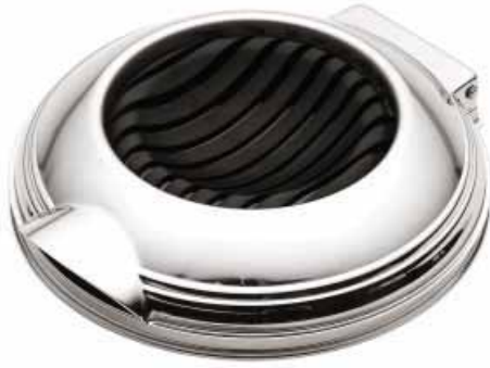
3564 Stainless Steel Mozzarella Cheese Slicer List $35