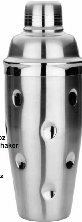
3244 Stainless Steel 8oz List $24