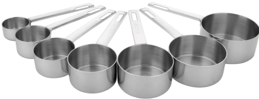
91688 Set of 7 Measuring Cups 1/8, 1/4, 1/3, 1/2, 2/3, 3/4, & 1 cup List $50

Heavy duty stainless steel measuring cups lives up to the demand of a commercial kitchen yet elegant for the home. Measurements are stamped onto the long handles. The cups nest for space saving storage. Polished exterior, brushed interior. Dishwasher safe.