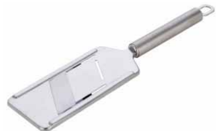
11240 Handheld Mandoline List $16