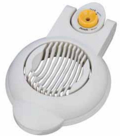
481 Egg Cutter & Piecer List $10