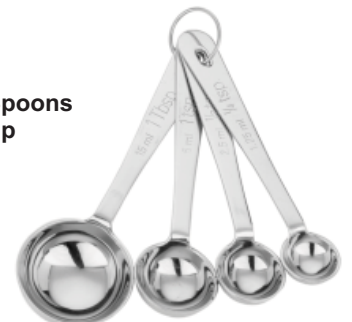
92026 Set of 4 Measuring Spoons 1/4, 1/2, 1 tsp & 1 tbsp List $6