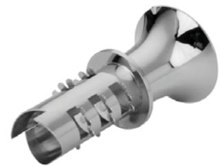
3386 Stainless Steel Mini Citrus Trumpet Set of 2 List $20