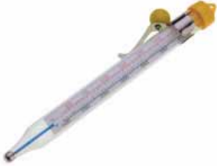
90071 Candy Thermometer Glass Tube NSF Certified List $10

Oven-proof glass lens allows continued use while cooking. Cooking thermometer reads instant temperature on large 3 inch dial. Temperature range 130 to 190 degrees Fahrenheit (54 to 88 degrees Celsius). Perfect for roasts, the dial suggests temperatures for various meats. Use on foods cooked in oven, grill, and smoker.