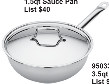
95033 3.5qt Chefs Pan List $70