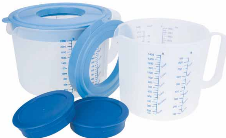
1009 2 Piece Mixing / Measuring Jugs 1.5 and 2.5 quarts List $20

These handy jugs are great for everyday use. With the center removable plug taken out, you can add ingredients into the jug and mix. Place the center plug back in for storage or keeping the ingredients from spilling.