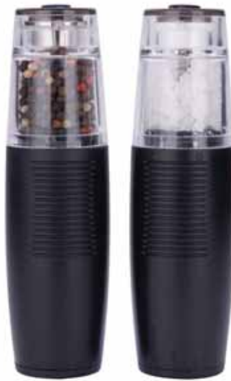
10000 Peppermill List $30