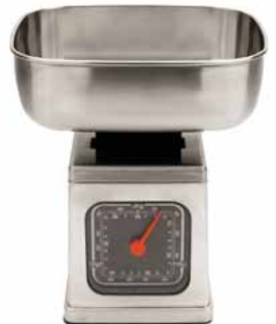
3573 Stainless Steel 6 lb Kitchen Scale List $80