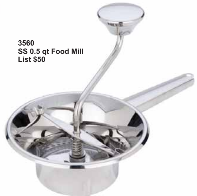
3560 SS 0.5 qt Food Mill List $50