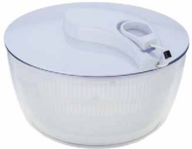
487 Pull String Salad Spinner List $25