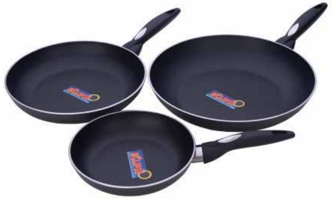
95009 Aluminum fry pan set of 3 8", 10", 12" - non stick List $100