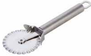
11203 Large Pastry Cutter List $16