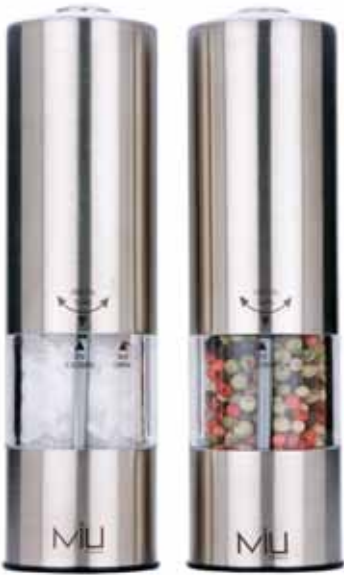
90604 Salt mill List $50