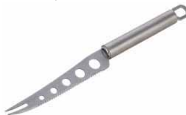
11235 Cheese Knife List $12