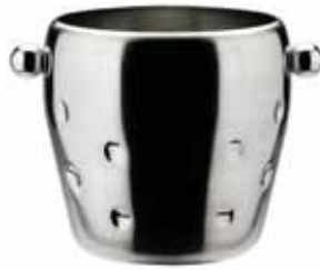
3231 Stainless Steel Dimpled Champagne Cooler List $80