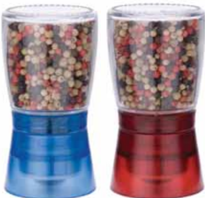
90610 Red Spice mill Ceramic grinder List $20