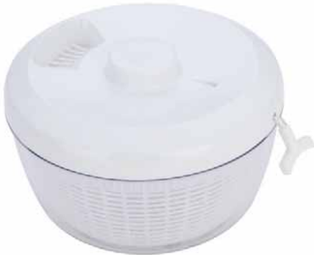
590 Pull String Drain Through Salad Spinner List $31