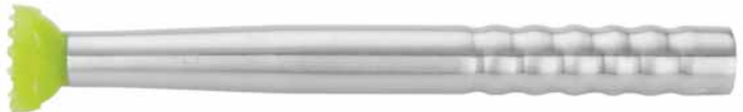
3832 Stainless Steel 10" Mojito Muddler List $18