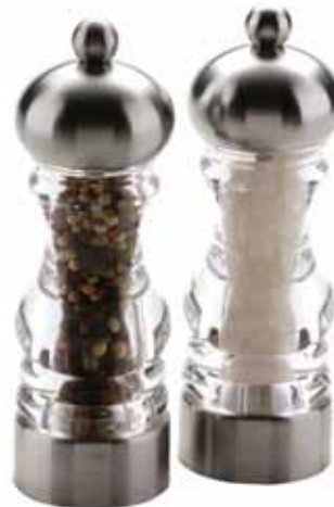
90625 Peppermill or Salt mill List $35

90600 Dual Pack Salt and Peppermill List $100