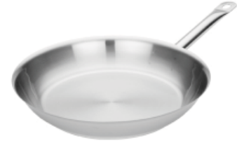
95039 12" Open Fry pan List $70