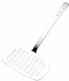
10910 Fish Turner 18/10 SS List $20