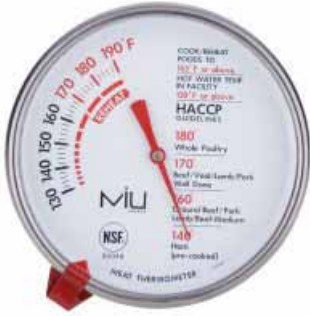
90048 Meat Thermometer NSF Certified List $15