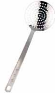
10901 Soup Skimmer 18/10 SS List $20