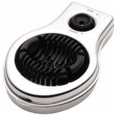
3792 Stainless Steel Egg Cutter & Piecer List $45