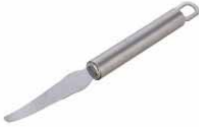
11204 Grapefruit Knife List $12