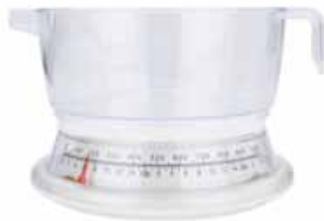
598 2 lb Kitchen Scale List $20