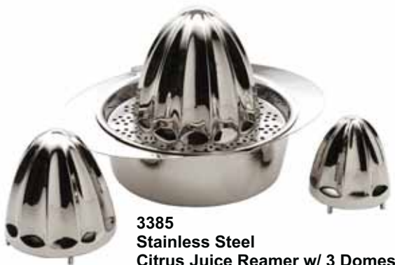
3385 Stainless Steel Citrus Juice Reamer w/ 3 Domes List $50