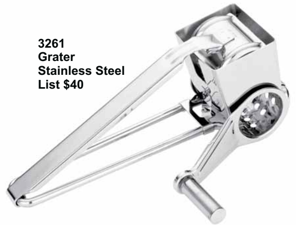
3261 Grater Stainless Steel List $40