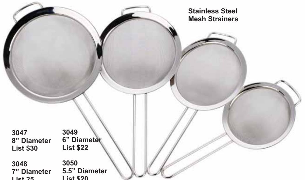
Stainless Steel Mesh Strainers