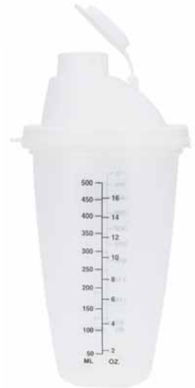
480 Plastic 20oz Cocktail Shaker List $5