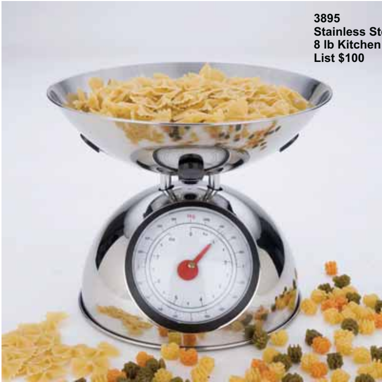
3895 Stainless Steel 8 lb Kitchen Scale List $100