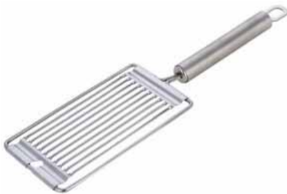
11222 Tomato Slicer List $12