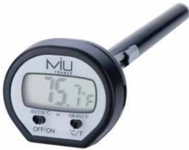
90004 Instant Read Digital Pocket Thermometer List $20

Electronic cooking thermometer with probe for perfectly cooked meats and poultry. Probe remains in food as it cooks; track internal temperature without opening the oven. Heavy-duty plastic; metallic finish; probe is stainless steel. Easy-to-read digital display; custom programming function; 15 preset options for different meats Measures 4-1/2 by 2-3/4 inches Comes with a AAA battery