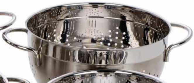
3132 6qt 10" diameter List $60