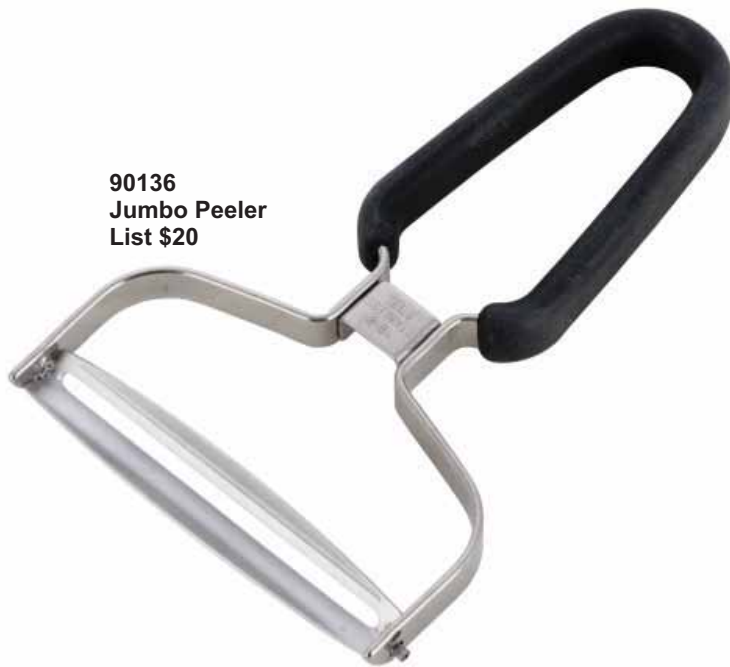
90136 Jumbo Peeler List $20