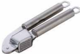
11220 Garlic Press List $20