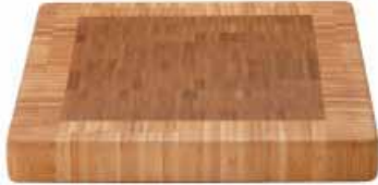
90030 Cutting Board 6.5" square x 1.5" thick List $15

Our bamboo boards are beautiful, functional, and ecologically sensitive. Bamboo is 17% harder than maple, making it an excellent cutting surface. Our boards are assembled with approved food grade glue. No dyes or stains are used in the manufacturing process. The pleasing designs are created by using the naturally occurring variations within the grain. Bamboo is a harvested grass that can grow as much as 2 feet per day. It does not require replanting, it throws off new shoots naturally, making it one of the most renewable resources known.