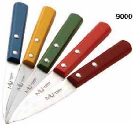
90006 French Style Paring Knife Beechwood Handle Set of 5 List $30