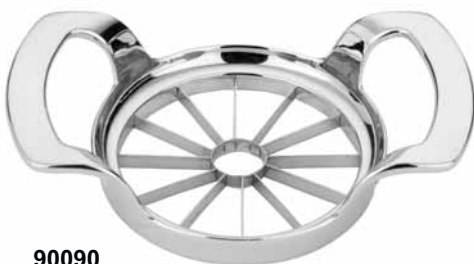
90090 Zinc Alloy Apple Cutter & Corer List $20