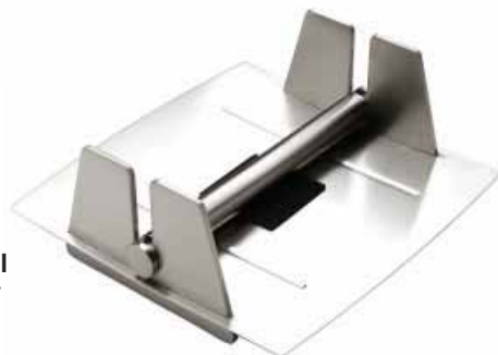
3594 Stainless Steel Napkin Holder List $60