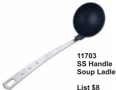
11703 SS Handle Soup Ladle