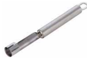
11209 Apple Corer List $11