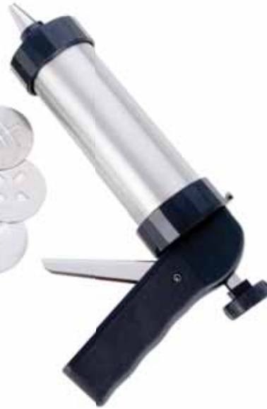
NEW 3888 Stainless Steel 22 Pc Decorator Set List $70