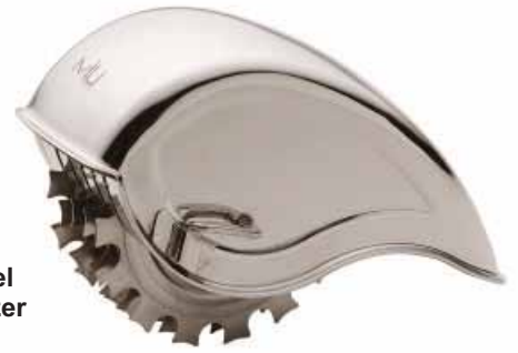
93263 Stainless Steel Meat Tenderizer List $40