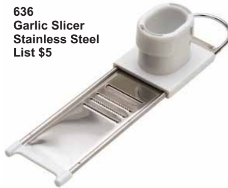
636 Garlic Slicer Stainless Steel List $5