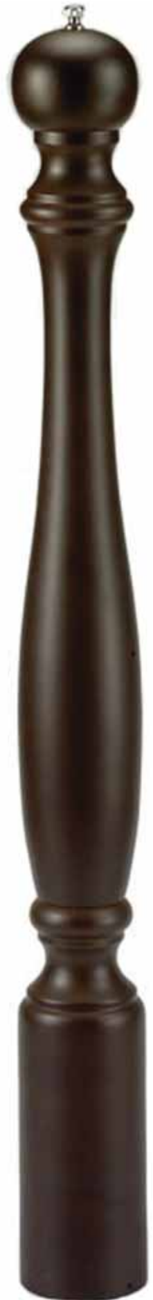
90619 Peppermill, 36" List $200