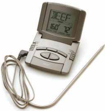
93081 Thermometer / Timer Digital Probe List $40

Electronic cooking thermometer with probe for perfectly cooked meats and poultry. Probe remains in food as it cooks; track internal temperature without opening the oven. Heavy-duty plastic; metallic finish; probe is stainless steel. Easy-to-read digital display; custom programming function; 15 preset options for different meats Measures 4-1/2 by 2-3/4 inches Comes with a AAA battery