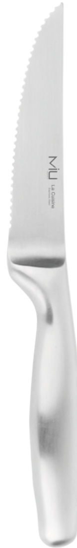
90017 4.5" Gaucha Stainless Set of 4 List $40