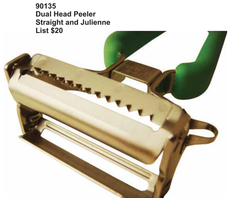
90135 Dual Head Peeler Straight and Julienne List $20