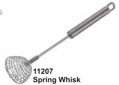
11207 Spring Whisk List $16