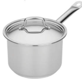
95031 2.4qt Sauce Pan List $60