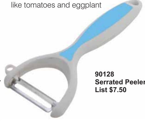
90128 Serrated Peeler List $7.50

For soft skin fruits and vegetables like tomatoes and eggplant