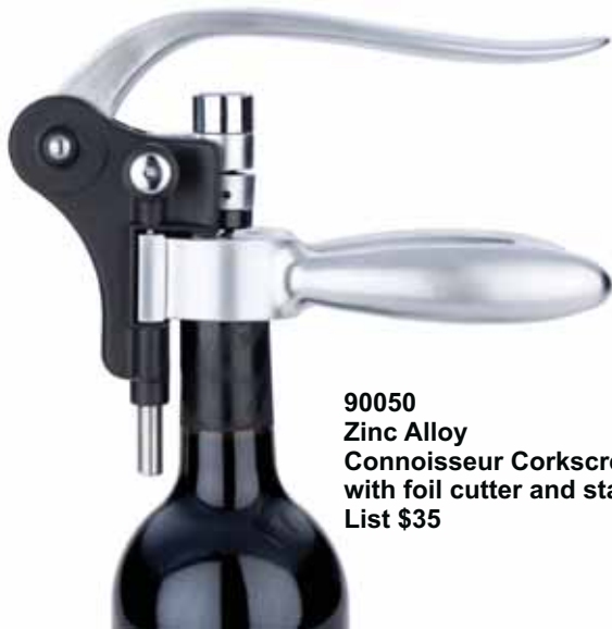
90050 Zinc Alloy Connoisseur Corkscrew Set with foil cutter and stand List $35