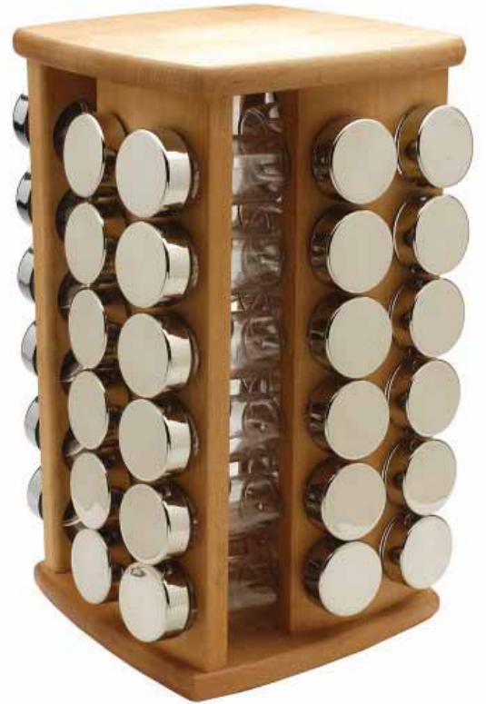
90630 48 Jars Spinning Beechwood Spice Rack 16.5" x 12" x 12"