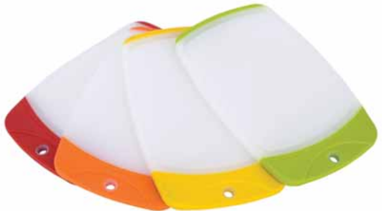
90029 12"x15"x0.75" List $40