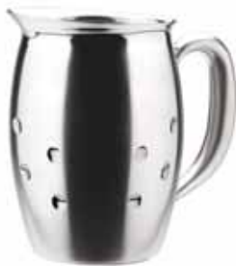
3417D Stainless Steel Dimpled Water Pitcher 2.5 qts List $70