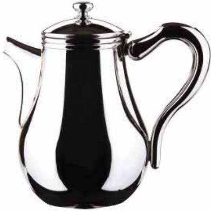
3700 Stainless Steel Coffee Pot - 1.5 qt List $90