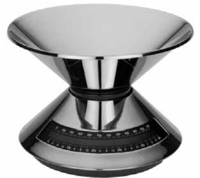
3728 Stainless Steel 5 lb Kitchen Scale List $60