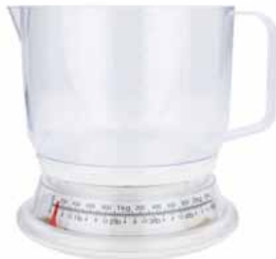
586 5 lb Kitchen Scale List $25