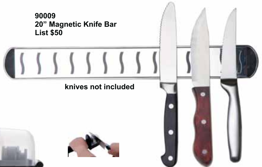
90009 20" Magnetic Knife Bar List $50

15" Size: 15" x 2"D x 1"H 20" Size: 20" x 2"D x 1"H