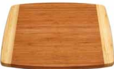
90027 5.5"x8"x0.75" List $10