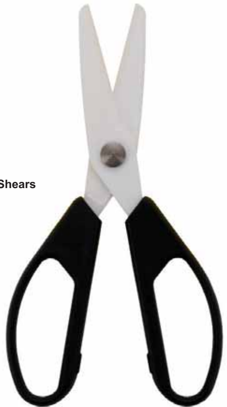
94061 Ceramic Kitchen Shears List $50