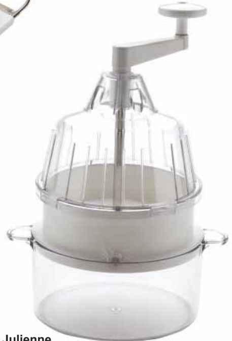
90003 Vegetable Julienne Spiral Slicer