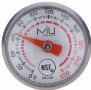
90039 Instant Read Analog Pocket Thermometer NSF Certified List $10

5-inch stainless-steel stem 1-inch dial instantly displays temperatures from 0 to 220°F Dial is protected by a shatterproof plastic lens Thermometer can be recalibrated Pocket case included