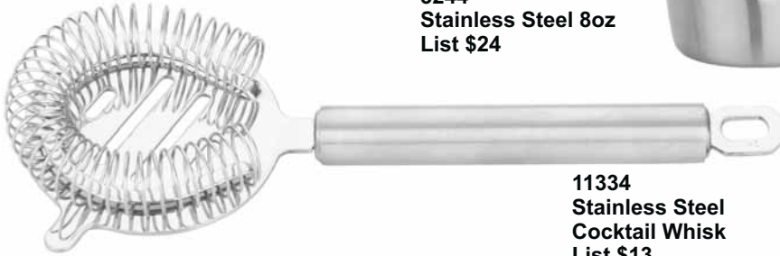
11334 Stainless Steel Cocktail Whisk List $13