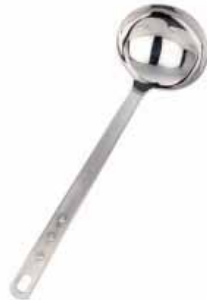
10903 Soup Ladle 18/10 SS List $20