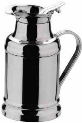
3458 Stainless Steel Thermo Carafe - 28 oz List $100