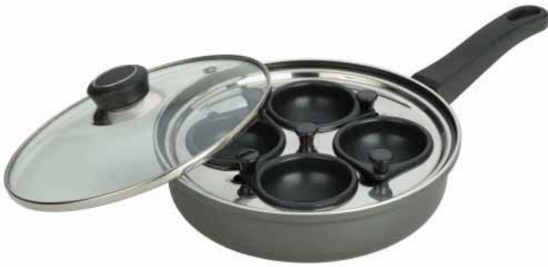
95024 Aluminum 4 cup egg poacher List $70