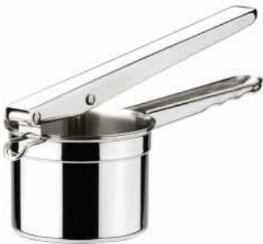
3078A SS Potato Ricer with 2 Disks List $70