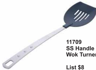
11709 SS Handle Wok Turner