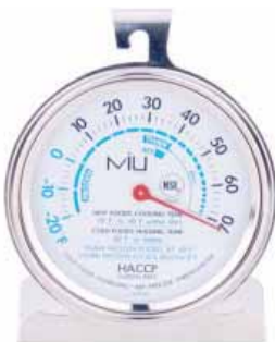
90062 Thermometer, 3” dial Commercial Freezer NSF Certified List $15

Easy-to-read 3-inch dial Measures temperatures from 40 to 500°F Professional quality and accuracy Safe temperature zone guide Can be set on base or hung (base rotates for use as secure hanger) 18/10 Stainless steel