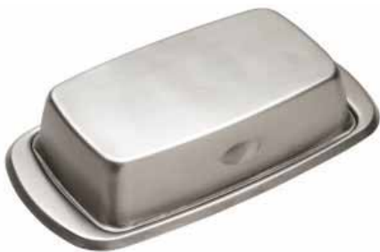
3332 Stainless Steel Butter Dish List $25