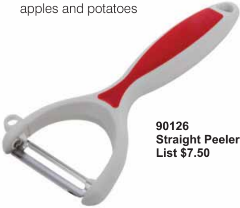
90126 Straight Peeler List $7.50

For hard fruits and vegetables like apples and potatoes