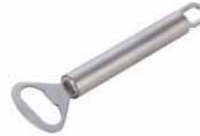
11237 Bottle Opener List $10