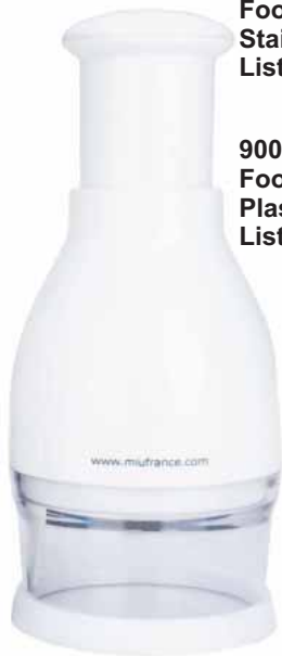
90002 Food Chopper Plastic List $20