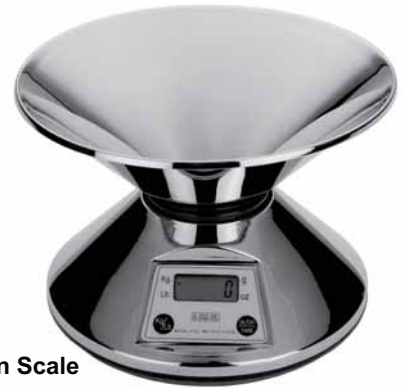
202 Stainless Steel 11 lb Digital Kitchen Scale List $85