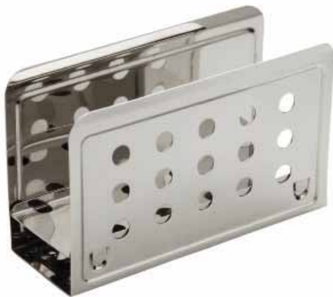
3602 Stainless Steel Sponge Holder List $13