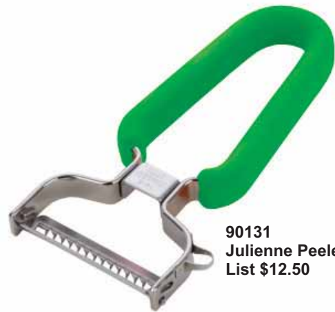
90131 Julienne Peeler List $12.50