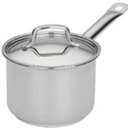
95030 1.5qt Sauce Pan List $40