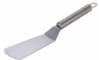
11231 Cake / Pie Server List $11