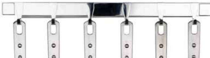
3137 Tool Bar w/hooks Stainless, 15"