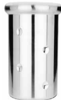
3077 Stainless Steel Dimpled Wine Cooler - Double Wall List $80