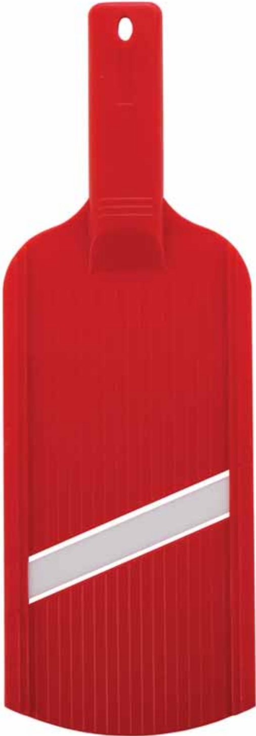
90710 Double Sided Ceramic Blade Slicer List $20