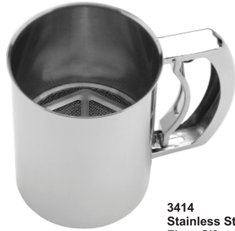
3414 Stainless Steel Flour Sifter List $55