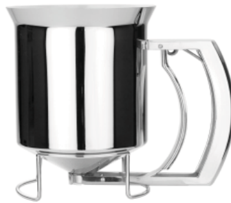
3766 Stainless Steel Pancake Dispenser List $40