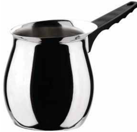
3340 Stainless Steel Milk Warmer - 20oz List $25