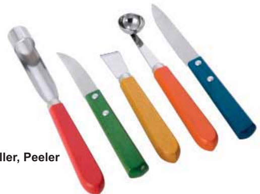
90008 French Style Garnishing Set Beechwood Handle Corer, Paring, Zester, Baller, Peeler Set of 5 List $40