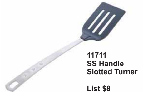
11711 SS Handle Slotted Turner