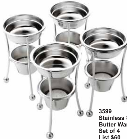
3599 Stainless Steel Butter Warmers Set of 4 List $60