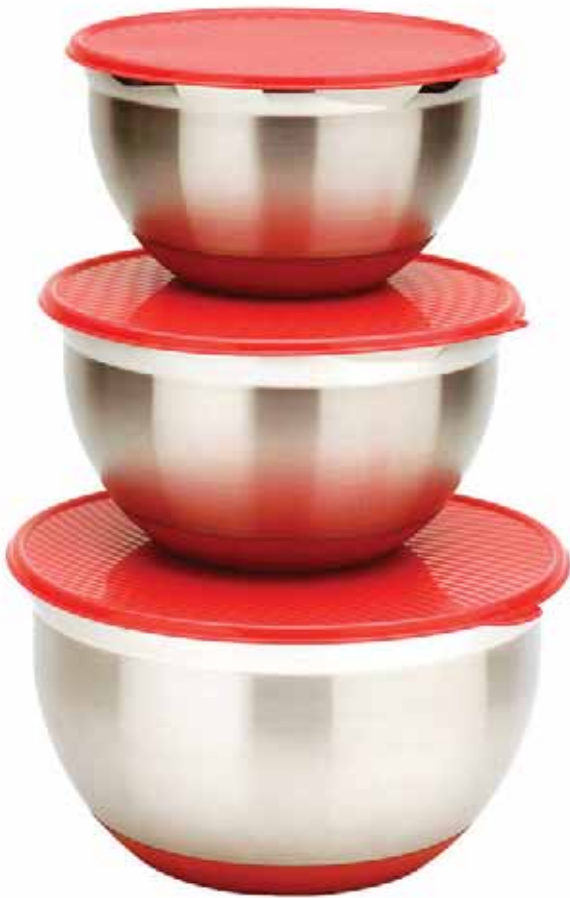
3481 Stainless Steel Mix Bowls w/ lids Set of 3 - RED List $150