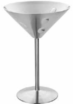
3703A Stainless Steel Dimpled Martini Glass List $22