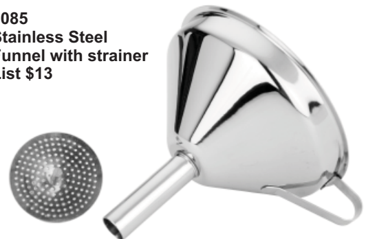
3085 Stainless Steel Funnel with strainer List $13