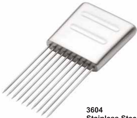
3604 Stainless Steel Tomato Holder List $13