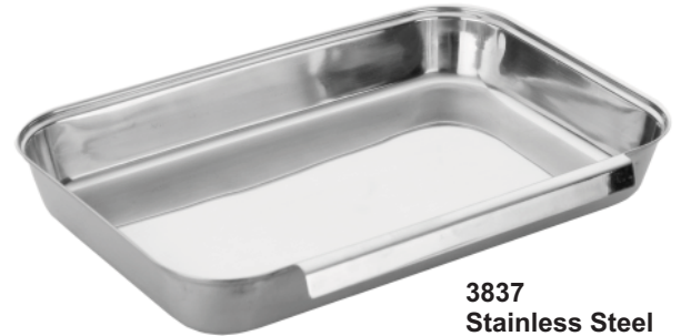
3837 Stainless Steel Breading Tray 8.5" x 5.5" x 1" List $20