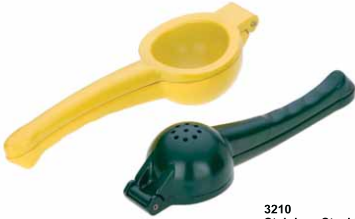
90098 Aluminum Lemon Squeezer List $20