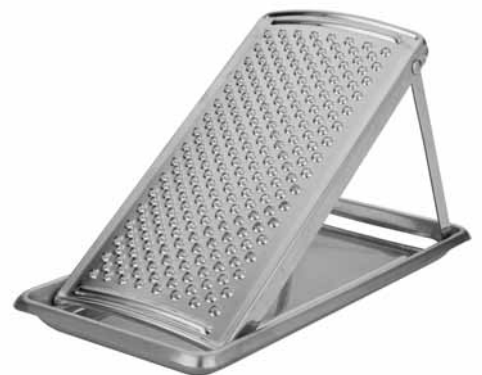
3008 Grater Stainless Steel List $20