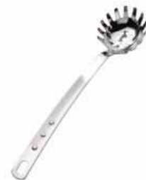
10905 Pasta Fork 18/10 SS List $20