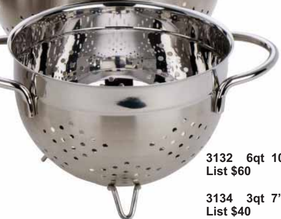
3134 3qt 7" diameter List $40