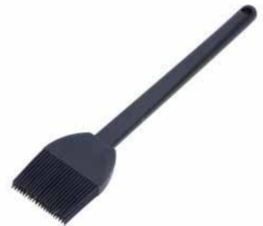
1124 Silicone Basting Brush Heat Resistant Handle List $13