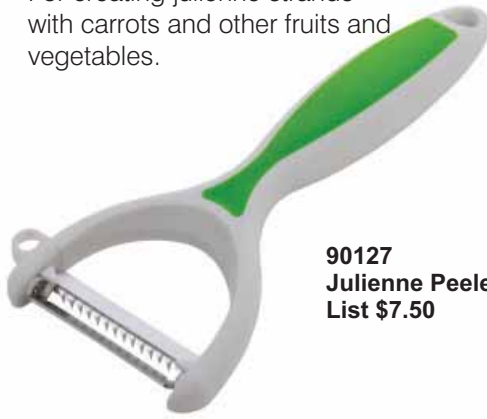
90127 Julienne Peeler List $7.50

For creating julienne strands with carrots and other fruits and vegetables.