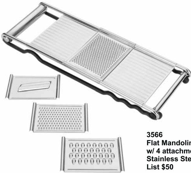
3566 Flat Mandoline w/ 4 attachments Stainless Steel List $50