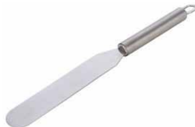
11229 Cake Icing Spatula List $12