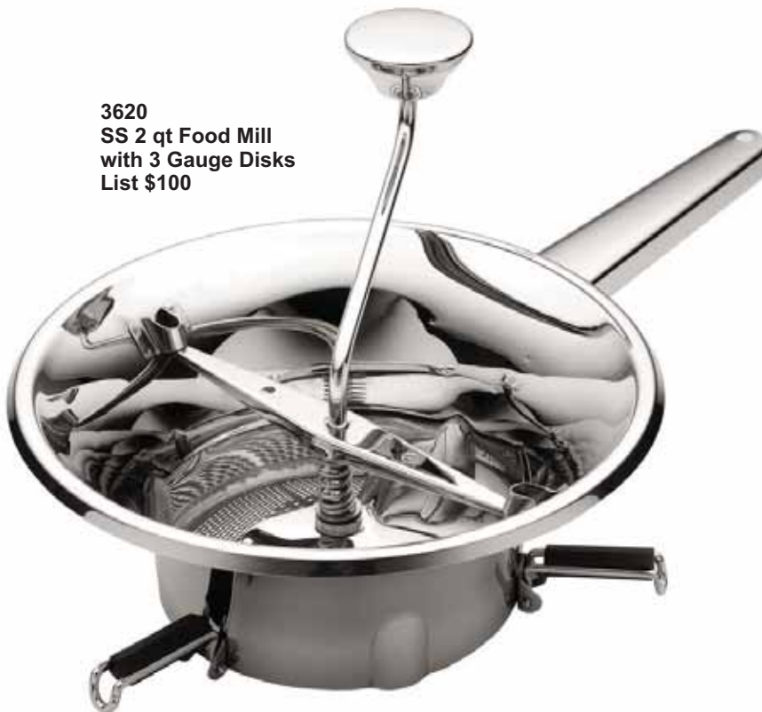
3620 SS 2 qt Food Mill with 3 Gauge Disks List $100