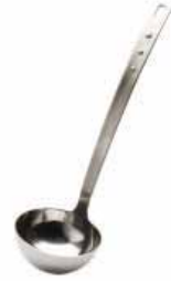
10907 Deep Soup Ladle 18/10 SS List $20