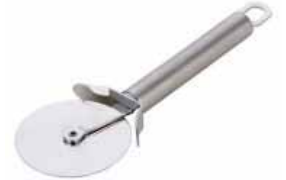
11205 Pizza Cutter List $16