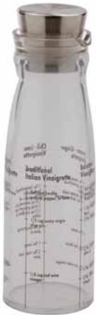
3331 Salad Dressing Shaker SS Stopper w/seal List $13