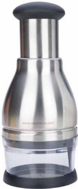
90001 Food Chopper Stainless Steel List $40