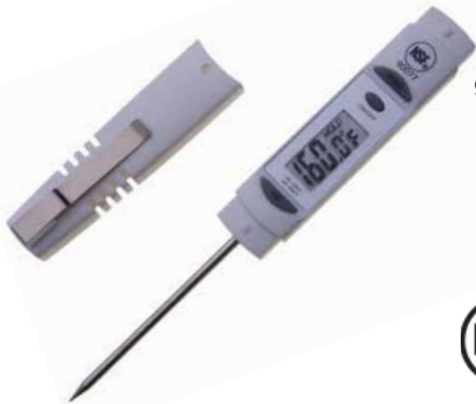
90077 Instant Read Digital Pocket Thermometer NSF Certified List $30

Easy-to-read LCD digits in Fahrenheit or Celsius Probe measures 4-3/4 inches -58°F (-50°C) to 500°F (260°C) Stainless steel probe registers temperature in seconds