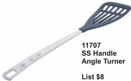
11707 SS Handle Angle Turner

Spice can be viewed through the glass lid making identification easy. By twisting the lid, you can choose between a sprinkle or a lot of spices. Magnetic base keeps the jars in place saving counter top space. Choose from either a 12 or 9 jar set. 11.5" high.