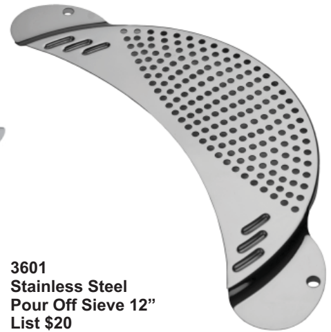
3601 Stainless Steel Pour Off Sieve 12" List $20