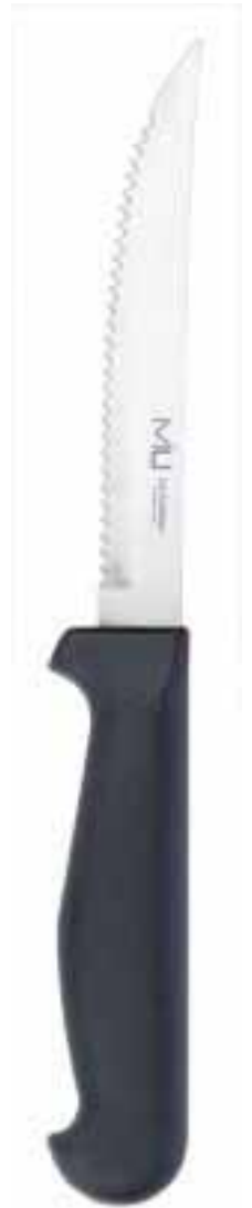
90055 4.5" Food Service PP Handle Set of 12 List $20