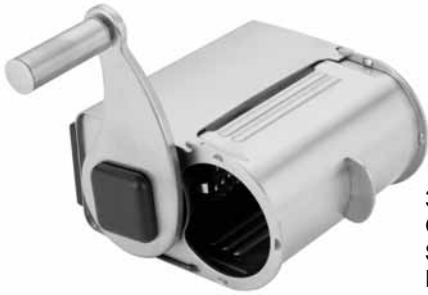
3368 Grater Stainless Steel List $35