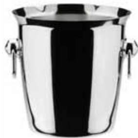
3193 Stainless Steel Wine Cooler List $60