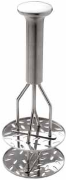
3790 Stainless Steel Potato Press List $20