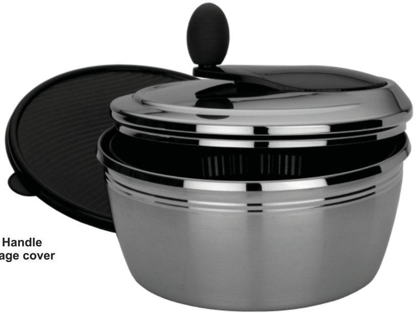
3189 Stainless Steel Crank Handle Salad Spinner w/ storage cover List $100