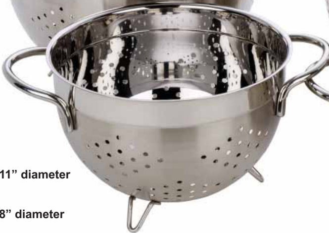
3133 4qt 8" diameter List $45