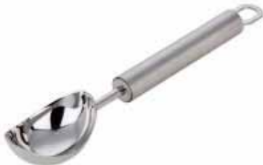
11213 Ice Cream Scoop List $13