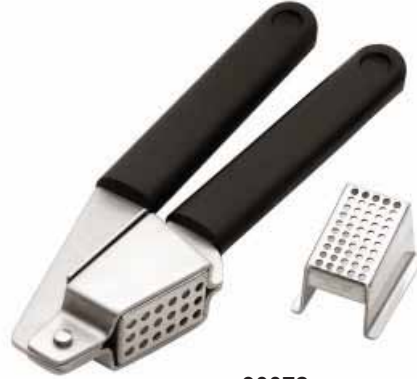
90072 SS Garlic Press With 2 Gauge Head List $20