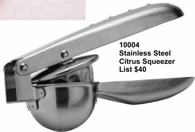
10004 Stainless Steel Citrus Squeezer List $40