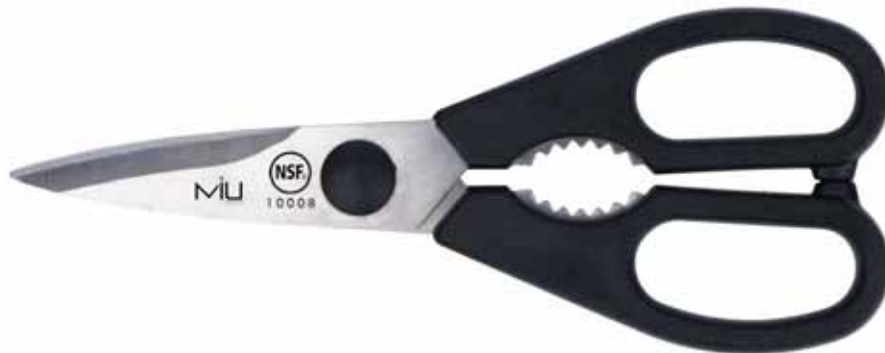
10008 Black Kitchen Shears List $15