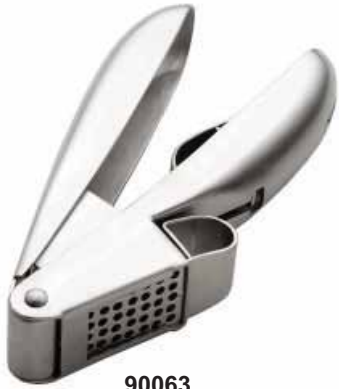
90063 Stainless Steel Garlic Press List $20