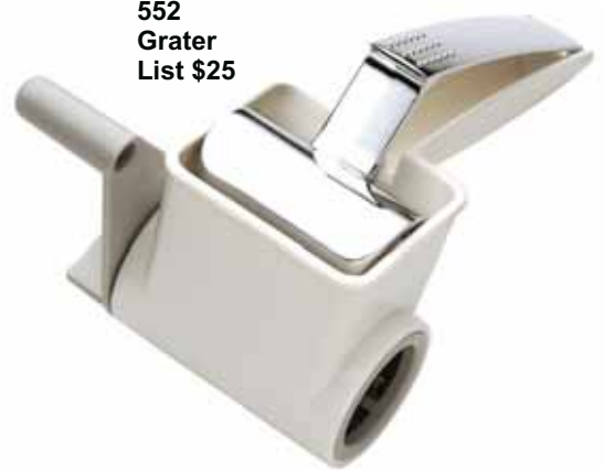
552 Grater List $25