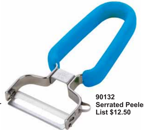
90132 Serrated Peeler List $12.50