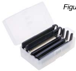
Figure 11 The straight, serrated and julienne blades should be stored in the plastic holder as shown in figure 11.